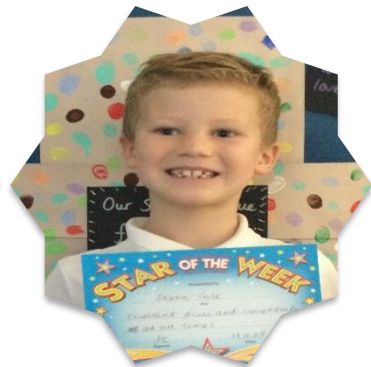
Year 2: Saxon