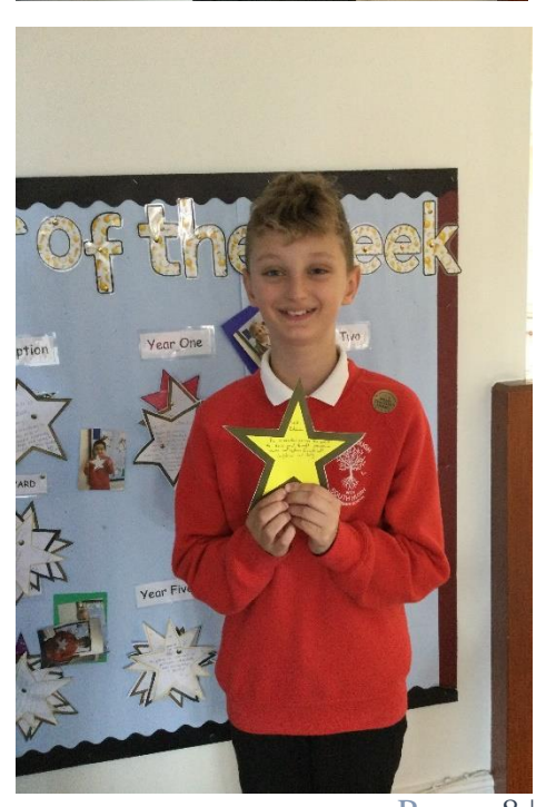
Page8 | 11